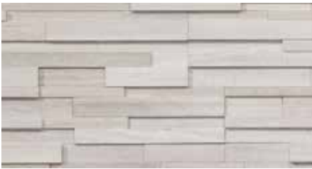
WHITE BIRCH HONED (Limestone), Panel: 6" x 24" | 1 sq.ft. Thickness: 0.5"-1.00" Weight: 7-11 lbs. Panels per carton: 6