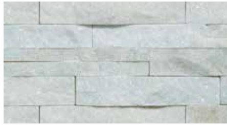
ARCTIC WHITE (Quartzite), Size: 6" x 24" | 1 sq.ft. Thickness: 0.5"-1.5" Weight: 10 lbs. / Panels per carton: 6