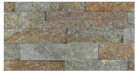
COPPER (Quartzite), Size: 6" x 24" | 1 sq.ft. Thickness: 0.5"-1.5" Weight: 10 lbs. / Panels per carton: 6