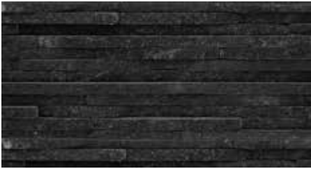
THIN MIDNIGHT SKY SHADOWSTONE (Quartzite), Panel: 6" x 24" | 1 sq.ft. Thickness: 0.8"-1.0" Weight: 11 lbs. / Panels per carton: 6