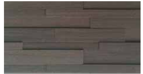
MOCHA HONED (Sandstone), Panel: 6" x 24" | 1 sq.ft. Thickness: 0.5"-1.00" Weight: 7-11 lbs. Panels per carton: 6