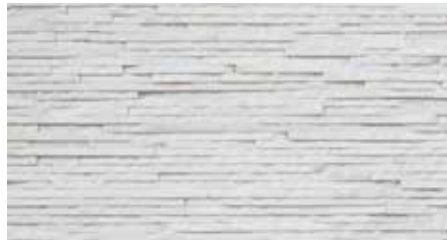
THIN ARCTIC WHITE ANGLED (Quartzite), Panel: 6" x 24" | 1 sq.ft. Thickness: 0.8"-1.0" Weight: 11 lbs. / Panels per carton: 6