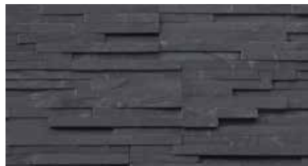
THIN CHARCOAL SHADOWSTONE (Slate*), Panel: 6" x 24" | 1 sq.ft. Thickness: 0.8"-1.0" Weight: 11 lbs. / Panels per carton: 6 * Moisture may cause this product to rust and effloresce.