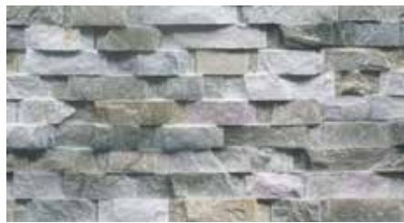
CHISELED SEA SHELL (Quartzite), Size: 6" x 24" | 1 sq.ft. Thickness: 0.5"-1.5" Weight: 10 lbs. / Panels per carton: 6