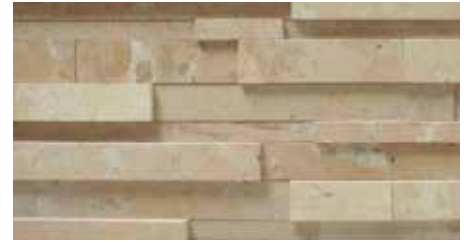
ROMAN BEIGE HONED (Limestone), Panel: 6" x 24" | 1 sq.ft. Thickness: 0.5"-1.00" Weight: 7-11 lbs. Panels per carton: 6