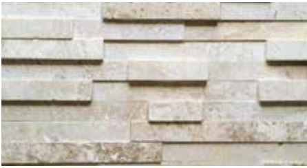
LATTE HONED (Travertine), Panel: 6" x 24" | 1 sq.ft. Thickness: 0.5"-1.00" Weight: 7-11 lbs. Panels per carton: 6