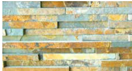
THIN TERRACOTTA SHADOWSTONE (Slate),

Panel: 6" x 24" | 1 sq.ft. Thickness: 0.8"-1.0" Weight: 11 lbs. / Panels per carton: 5