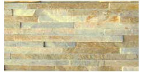
THIN SIERRA SHADOWSTONE (Quartzite)