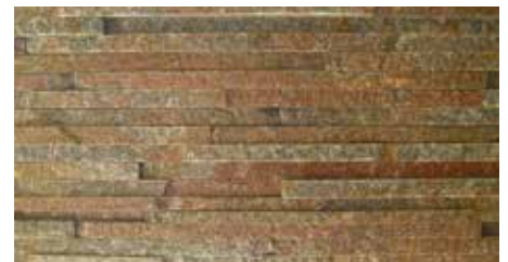
THIN COPPER SHADOWSTONE (Quartzite) Limited Quantities