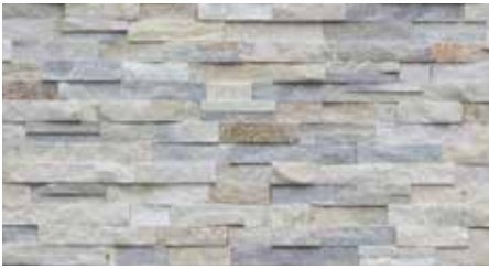
SILVER ALABASTER (Quartzite), Size: 6" x 24" | 1 sq.ft. Thickness: 0.5"-1.5" Weight: 10 lbs. / Panels per carton: 6