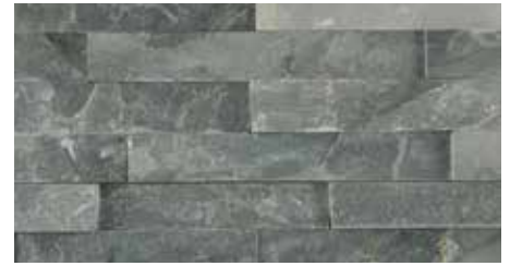
BLUESTONE (Slate) Size: 6" x 24" | 1 sq.ft. Thickness: 0.5"-1.5" Weight: 10 lbs. / Panels per carton: 6