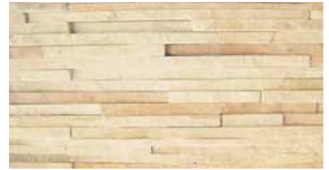
THIN BLUSH SAND SHADOWSTONE (Sandstone), Limited Quantities