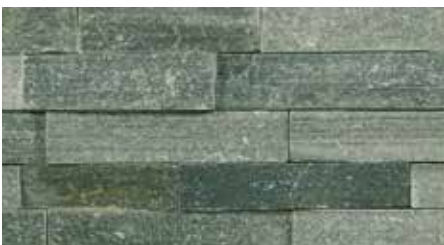
CYAN GREEN (Quartzite), Panel: 6" x 24" | 1 sq.ft. Thickness: 0.5"-1.5" Weight: 10 lbs. / Panels per carton: 6