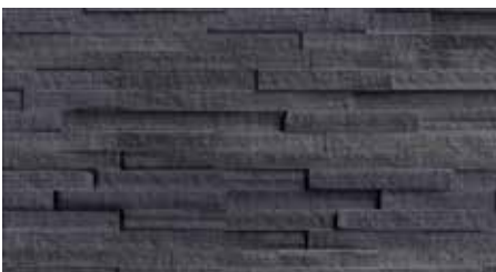
MOCHA LEDGESTONE (Sandstone), Panel: 6" x 24" | 1 sq.ft. Thickness: 0.6"-1.00" Weight: 11lbs. Panels per carton: 6