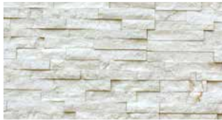
WHITE BIRCH LEDGESTONE (Limestone) Panel: 6" x 24" | 1 sq.ft. Thickness: 0.6"-1.00" Weight: 8-9 lbs. Panels per carton: 6