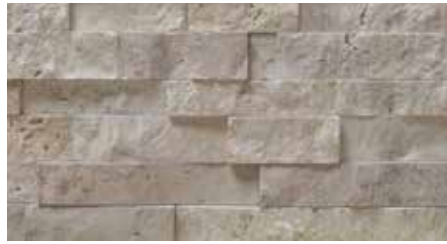
LATTE LEDGESTONE (Travertine), Panel: 6" x 24" | 1 sq.ft. Thickness: 0.5"-1.00" Weight: 7-11 lbs. Panels per carton: 6