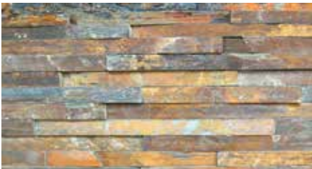
THIN TERRACOTTA LEDGESTONE