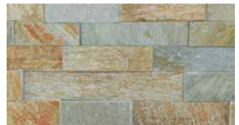
SIERRA (Quartzite), Panel: 6" x 24" | 1 sq.ft. Thickness: 0.5"-1.5" Weight: 10 lbs. / Panels per carton: 6