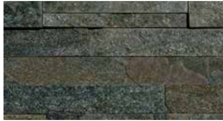
EMERALD (Quartzite), Limited Quantities