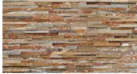
THIN MOUNTAIN RUST LEDGESTONE (Quartzite)