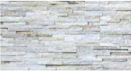
THIN SILVER ALABASTER SHADOWSTONE (Quartzite), Panel: 6" x 24" | 1 sq.ft. Thickness: 1"-1.5" Weight: 11 lbs. / Panels per carton: 6