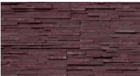
THIN BURGUNDY SHADOWSTONE (Sandstone), Limited Quantities