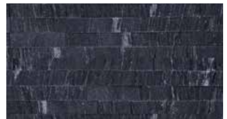
NERO LEDGESTONE (Granite), Panels: 6" x 24" | 1 sq.ft. Thickness: 0.6"-1.00" Weight: 11.5 lbs. Panels per carton: 6