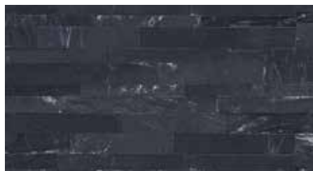
NERO HONED (Granite), Panels: 6" x 24" | 1 sq.ft. Thickness: 0.4"-0.8" Weight: 8.6 lbs. Panels per carton: 6