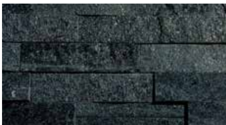
MIDNIGHT SKY (Quartzite), Panel: 6" x 24" | 1 sq.ft. Thickness: 0.5"-1.5" Weight: 10 lbs. / Panels per carton: 6