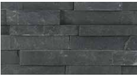
CHARCOL (Slate*) Size: 6" x 24" | 1 sq.ft. Thickness: 0.5"-1.5" Weight: 10 lbs. / Panels per carton: 6 * Moisture may cause this product to rust and effloresce