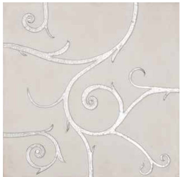
White with Silver Leaf and Swarovski crystals