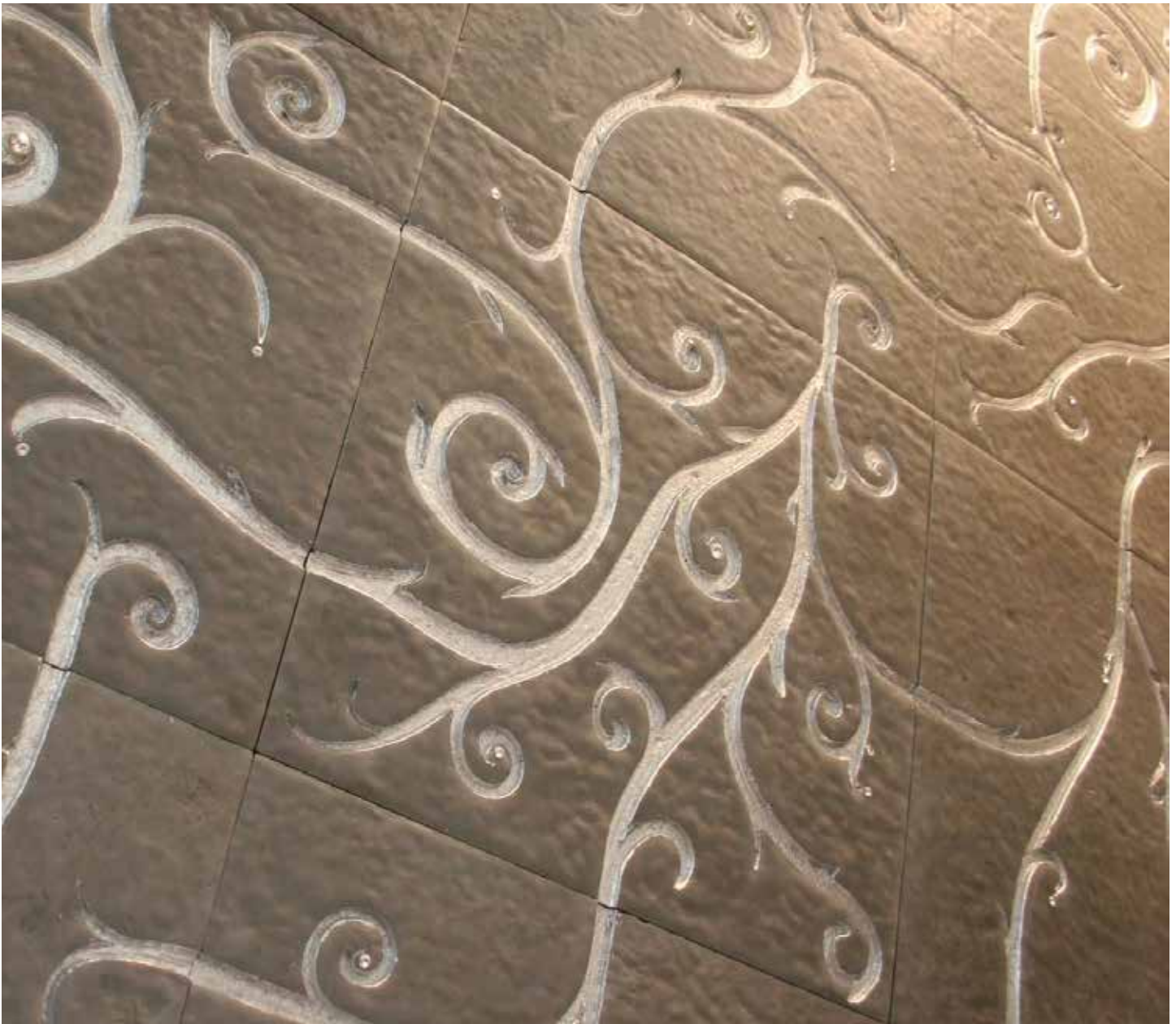
Light Grey with Silver Leaf and Swarovski crystals