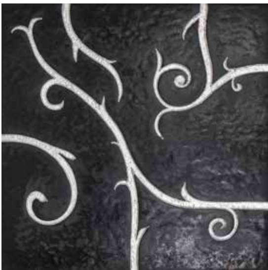
Black with Silver Leaf